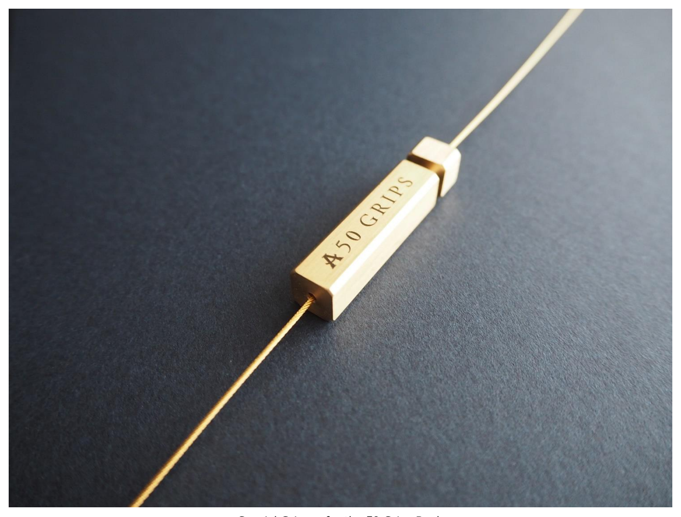
Special Gripper for the 50 Grips Book

As a firm that specializes in accentuating aesthetic qualities through colors and materials, STUDIO BYCOLOR has redefined the ARAKAWA GRIP by changing its color from SILVER to GOLD, thereby elevating it to a dignified and dominant presence in the space. The graphic design in gold and navy tones is by Sdanley Shen of MULTISTANDARD.